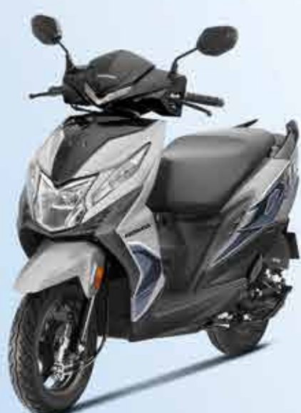
PEARL IGNEOUS BLACK + PEARL DEEP GROUND GRAY